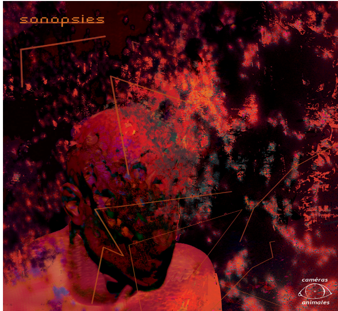
Exclusive cover art by g.cl4renko